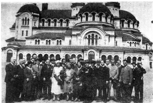
Figure 4. The memory picture from the First Congress in front of the cathedral in Sofia.