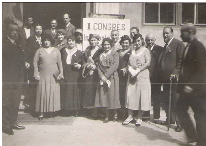
Figure 3. The participants of a scientific section at the First Inter-Balkan Otorhinolaryngology Congress.